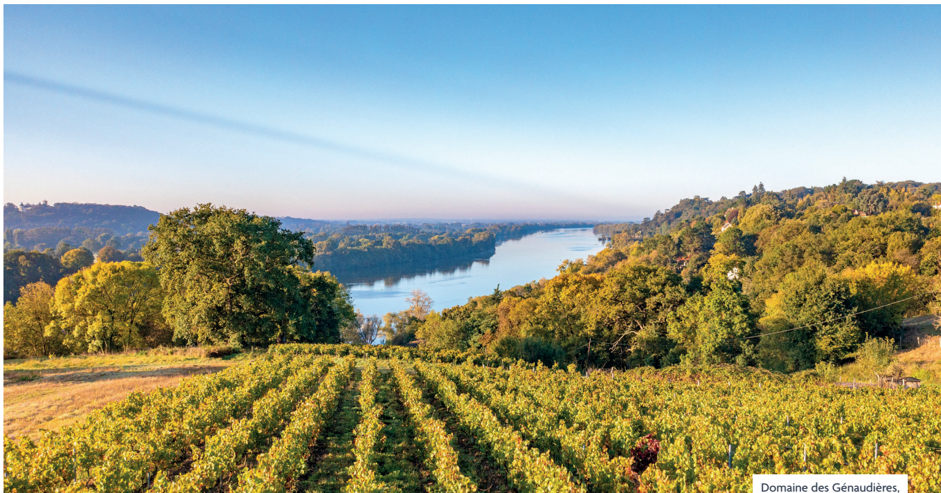
Domaine des Génaudières, Le Cellier